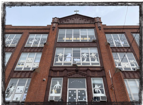
Santa kneels before the baby Jesus in this year's Christmas window display on the front side (middle window) of Holy Trinity School in Wallingford.

Just in time for the Wallingford Stroll in December, the eighth-grade students at Holy Trinity School in Wallingford completed their annual Christmas window display – to the delight of school neighbors and town residents.