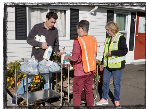
People who are suffering from food insecurity can pick up essentials on the campus of Blessed Sacrament Church in Hamden, part of St. Paul VI Parish, on the second and fourth Saturdays of the month from 9:30 to 10:30 a.m.